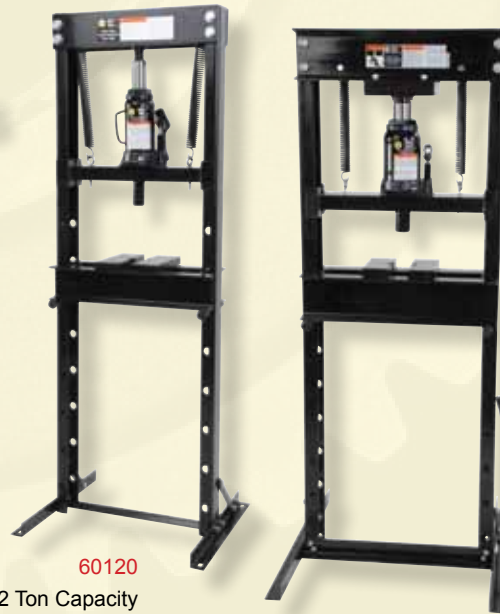
60120 12 Ton Capacity