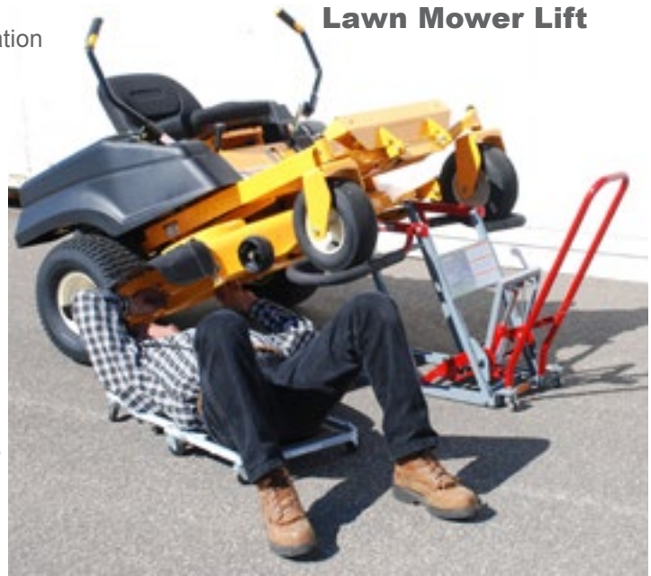
Lawn Mower Lift